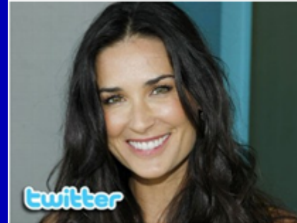
Actress-director Demi Moore arrives at the 2009 Miami International Film Festival for the screening...

Don't discount the power of people who follow stars on Twitter.